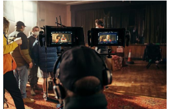
Eleanor Tomlinson and Stephen Merchant on set at Sea Mills Community Centre, Bristol