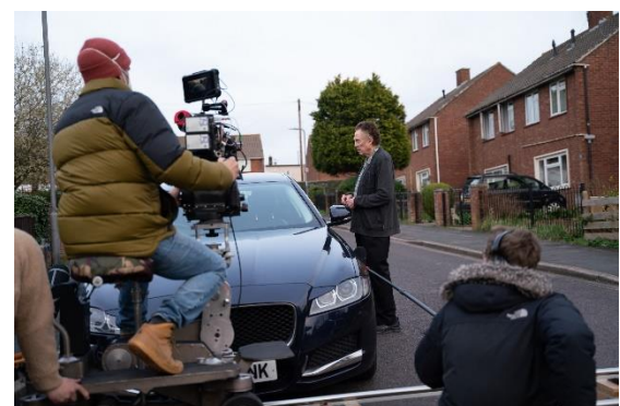
Christopher Walken films at Highmore Gardens, Lockleaze, Bristol