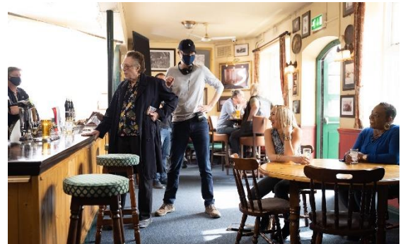
Christopher Walken and Stephen Merchant on set at The George Inn, Shirehampton, Bristol

Academy Award-winning actor Christopher Walken stars in his first lead British television role, alongside writer and director Stephen Merchant ( The Office , Jojo Rabbit ), with Rhianne Barreto ( Honour , Hanna ), Gamba Cole ( Soon Gone: A Windrush Chronicle , Hanna ), Darren Boyd ( Killing Eve ), Clare Perkins ( EastEnders ), Eleanor Tomlinson ( Poldark ), Jessica Gunning ( Back ) and Charles Babalola ( Bancroft ).