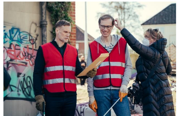
Darren Boyd & Stephen Merchant on set at Sea Mills Community Centre, Bristol