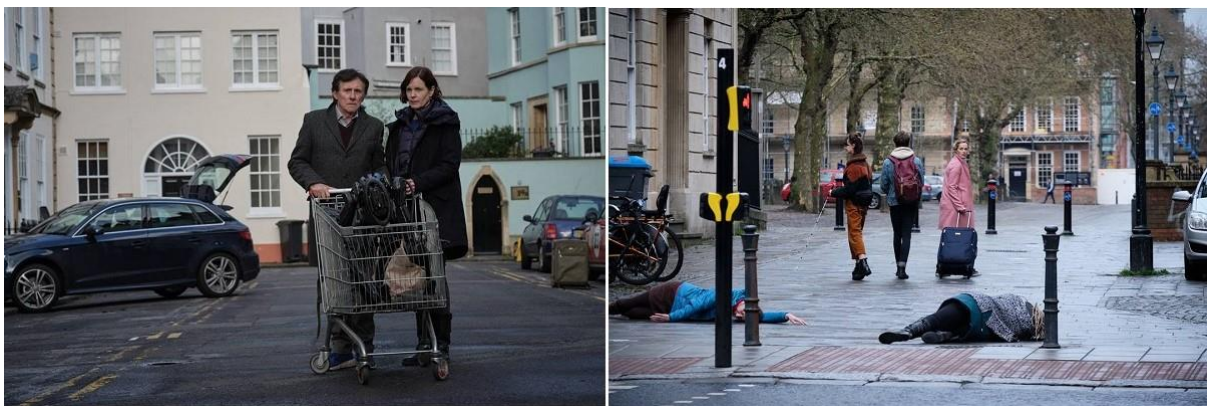
(left) Gabriel Byrne & Elizabeth McGovern in War of the Worlds (filmed on Orchard Street, Bristol) (right): Natasha Little in War of the Worlds (filmed on Queen Square, Bristol)