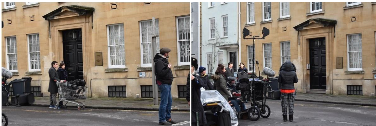
Gabriel Byrne & Elizabeth McGovern film on Orchard Street, Bristol