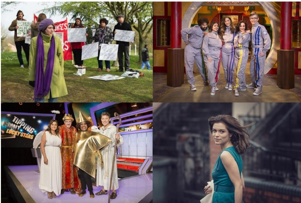
Clockwise from top left: The Cure (Story Films / Channel 4), The Crystal Maze Celebrity Christmas Special (Fizz TV / RDF Television / Channel 4), The Trial of Christine Keeler (Mammoth Screen / BBC), Tipping Point Lucky Stars Christmas Special (Fizz TV / RDF Television / ITV)

BRISTOL, 18 December 2019: This year's festive guide is full of TV shows made in Bristol to enjoy this Christmas - and there's plenty of locally-made titles to look forward to in 2020 too. Here's a roundup of shows to look out for, all filmed at The Bottle Yard Studios and/or on location in Bristol, with assistance from Bristol Film Office.